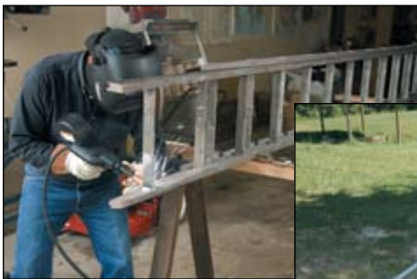
Great For Projects or Repair

Our low-priced spool gun is your most reliable aluminum feeding solution.