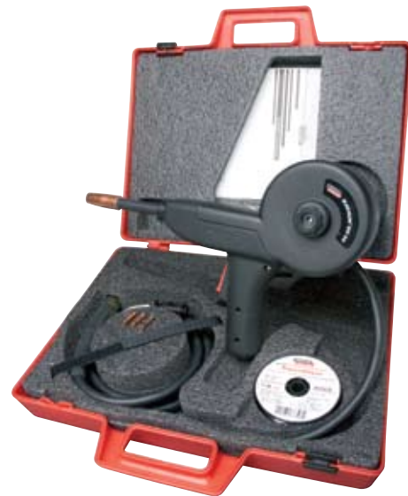
Complete Kit. No Bulky Module Required. Order K2532-1