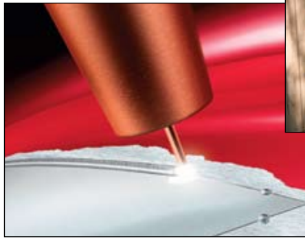
Thin Sheet Metal Autobody Work